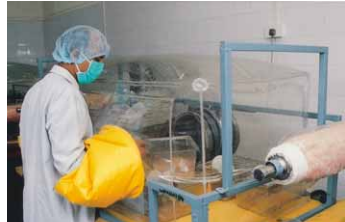
Isolator for work on small animals