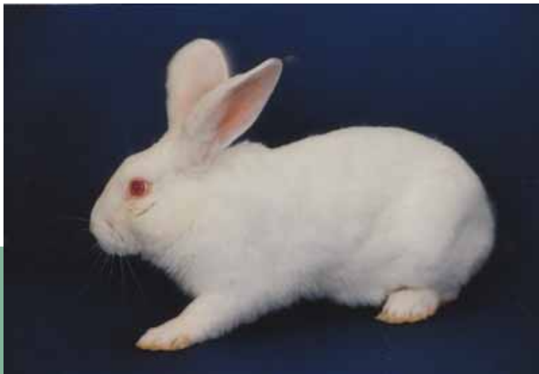
Rabbit ( Oryctolagus cuniculus ) Used for raising immune sera against different viruses