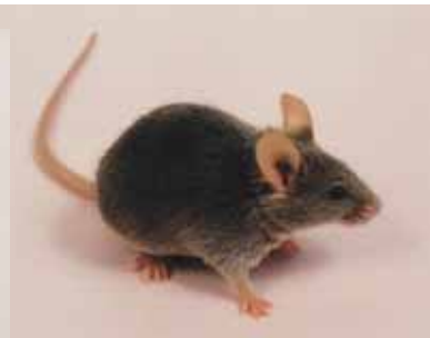
C3H / HeJ mouse

Mostly used in immunological research and to know the susceptibility to different viruses.