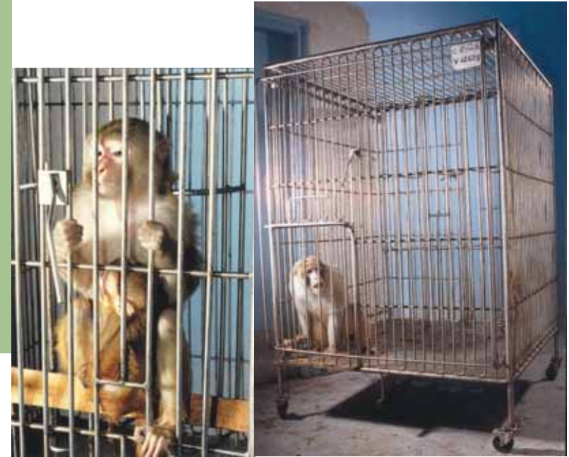
Monkeys are used for transmission experiments, vaccine evaluation and preparation of primary cell cultures.