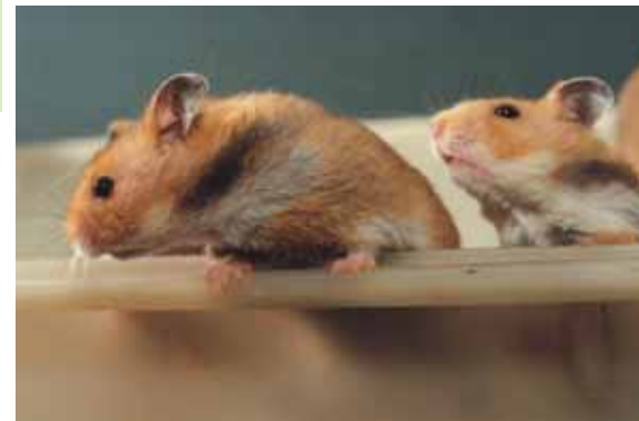
Hamster (Mesocricetus auratus)

Used to find out the susceptibility to different viruses and transmission studies.