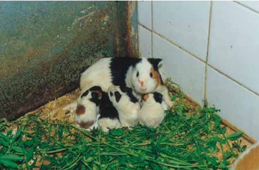
Guinea pig ( Cavia porcellus ) Used for raising immune serum. Source of complement in CF test. RBC's are used in diagnosis of influenza and rotavirus.