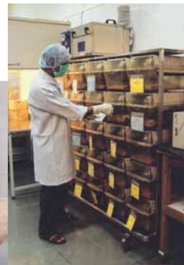
Individually ventilated mouse cages