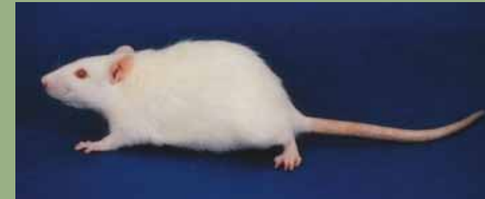
Rat (Rattus norvegicus)

Used to find out the susceptibility to different viruses and transmission studies.