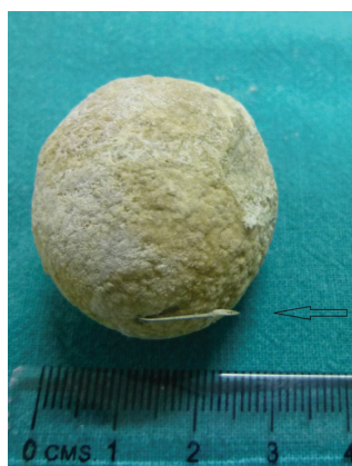
Fig. 2. A vesical stone with a needle (arrow).