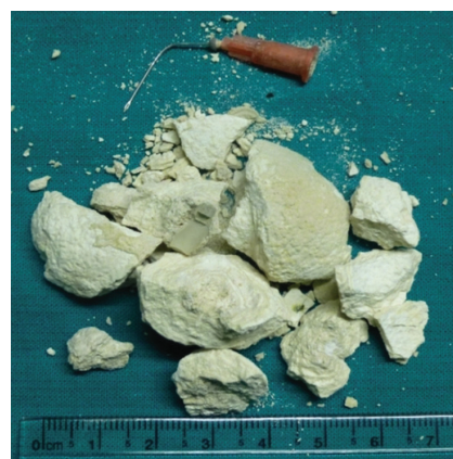
Fig. 3. A hypodermic needle was found after the stone was fragmented.

A 39 yr old male presented to the department of Urology, North Eastern Indira Gandhi Regional Institute of Health and Medical Sciences, Shillong, India, in October 2014, with poor urinary stream, dysuria and haematuria for three years. Clinical examination was unremarkable. Urine microscopy showed haematuria and leukocyturia. Pelvic radiograph showed a bladder stone with a foreign body at the centre (Fig. 1). On cystolithotomy, a 4 cm × 3 cm stone with a needle (Fig. 2) was removed. When the stone was fragmented, a hypodermic needle was found forming a nidus for the stone (Fig. 3). The patient had an uneventful recovery. He was asymptomatic at three