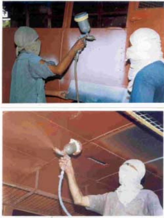
Fig.2. Spray painters exposed to solvents and chemicals

The levels of reproductive hormones (LH, FSH and testosterone) were not significantly altered in spray painters, however, isolated individual changes in the level of LH and FSH were registered in few spray painters. High level of FSH and LH in few spray painters is indicative of disruptive endocrine function. This study suggests that spray painters (Fig.2) are at risk of developing psychological, neurological, clinical, thyroid and reproductive impairments.