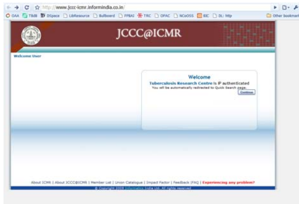
Fig. 29: Screenshot of JCCC@ICMR