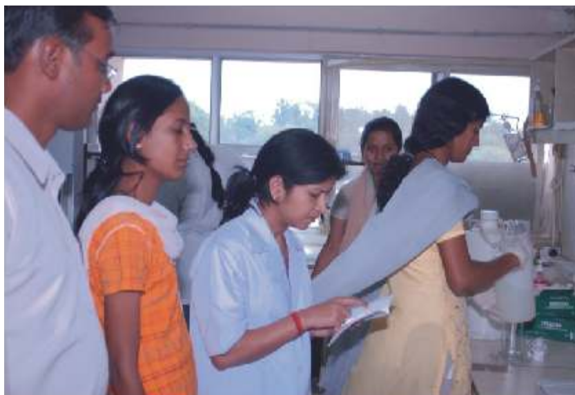
Students working in laboratory

The centre provides technical guidance and infrastructure facilities to PhD/ MD/ MSc students for conducting their research work for dissertation. Six PhD students are enrolled at the centre. Twelve students from different universities/institutions of the country had also carried out their Post-graduation dissertation work under the supervision of centre's scientists.