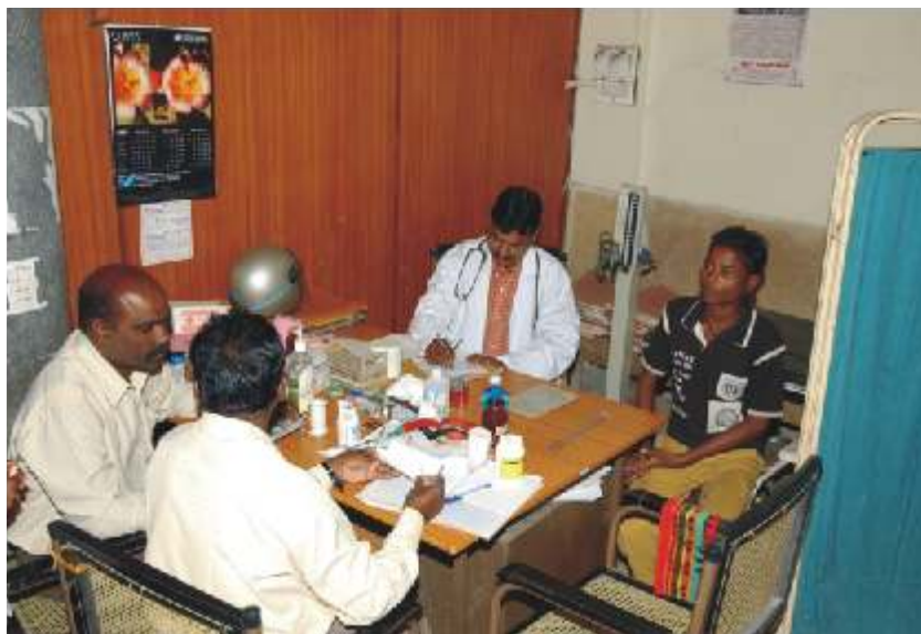
Sickle cell clinic at NSCB Medical College, Jabalpur

Centre runs a sickle cell clinic at N.S.C.B. Medical College, Jabalpur and offers the facilities for diagnosis of haemoglobinopathies to the patients of the areas. During the period of April 2007 to March 2008, a total of 824 persons suspected to be suffering from hemolytic anaemia and referred by various public sector hospitals were analysed for haemoglobinopathies. During the period 116 persons were identified as sickle cell disease, 92 as sickle cell trait, 46 as \alpha -thalassaemia trait, and 8 as \alpha -thalassaemia major. These patients and their parents were briefed about presentation and possible prognosis of the disorders and the preventive measures. The sickle cell disease patients were requested to get them registered in the Sickle Cell Clinic.