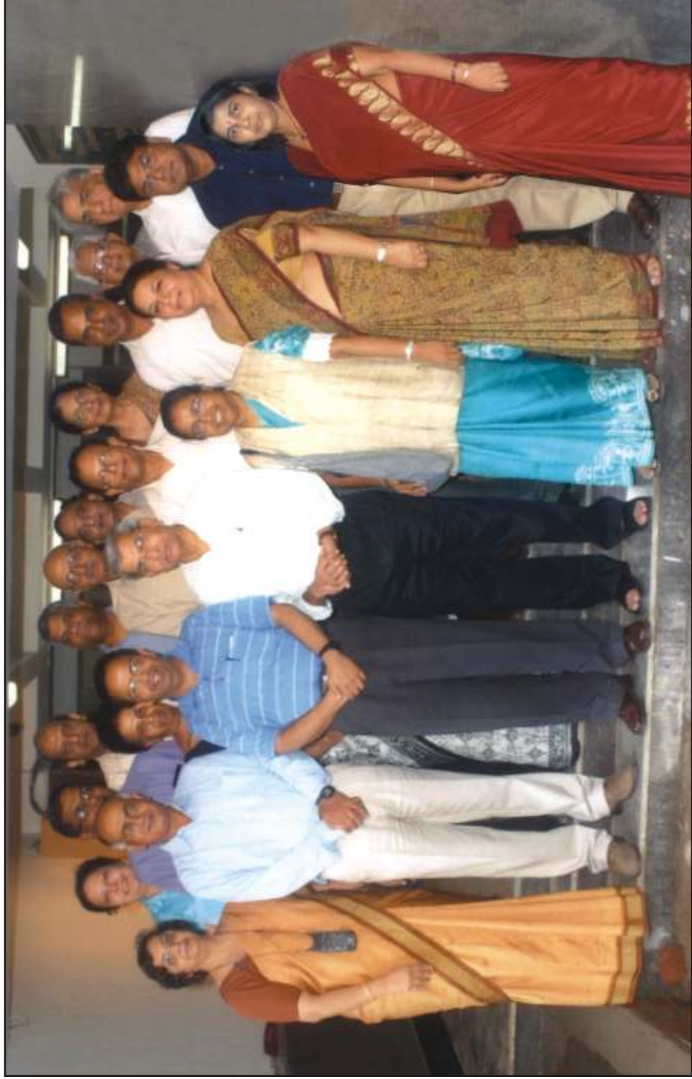
Members of the Scientific Advisory Committee of the National Institute for Research in Reproductive Health with some of the staff of the Institute.