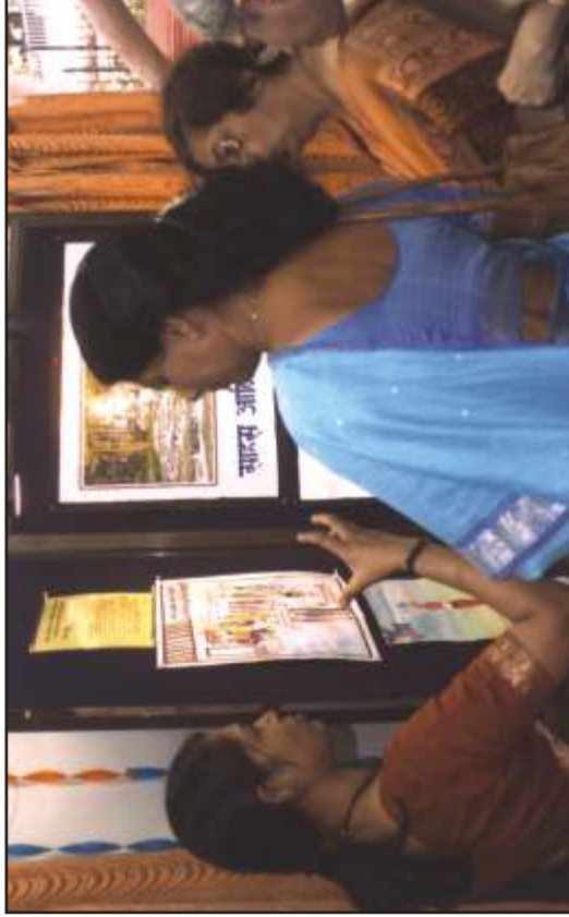
Blood donation camp and IEC activities organized at "JAGRUTI" adolescent centers in the year 2006.