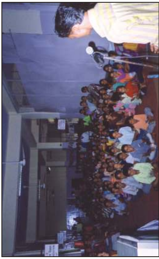
Inauguration of the Adolescent Friendly Centers "JAGRUTI", at Ramtekdi and V Shantaram health posts of Municipal Corporation of Greater Mumbai, Sewri, 27 February 2006.