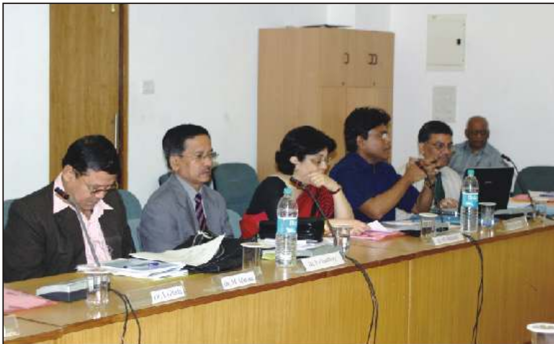
Dissemination meeting of National Guidelines on Prevention, Management and Control of RTIs/STIs participated by the officials from the Ministry of Health and Family Welfare, Government of India, NACO, UNFPA, WHO, NGOs and other stake holders on 28 December 2006.