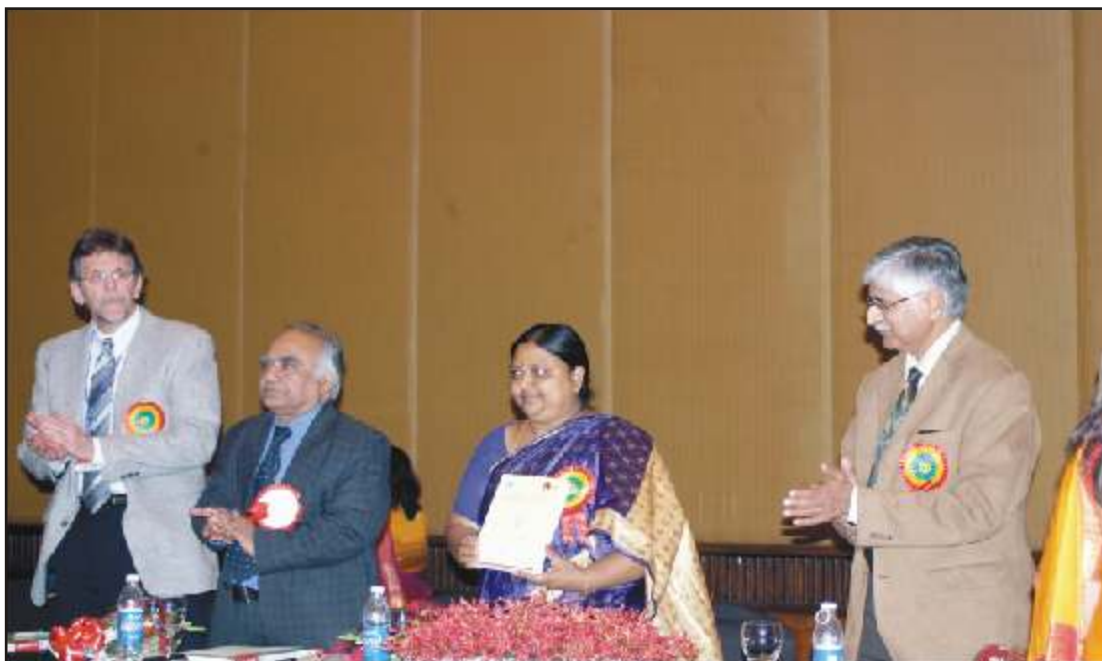
Smt. Panabaka Lakshmi, Honorable Minister for State for Health and Family Welfare, Government of India, releasing the souvenir of the International Conference on Actions to Strengthen Linkages Between Sexual and Reproductive Health and HIV/AIDS on 4 February 2007.